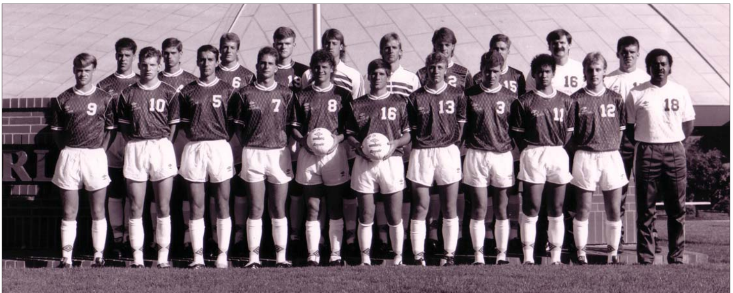
1988 University of Portland Pilots, NCAA College Cup