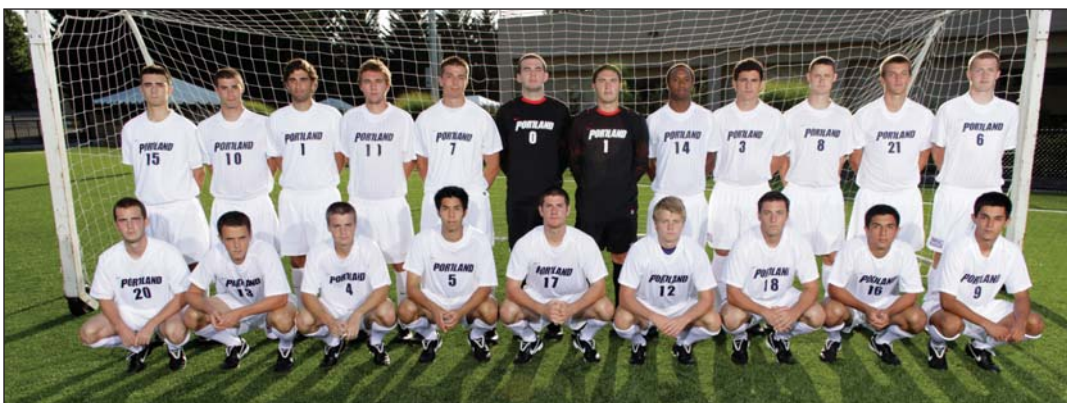
The 2009 Pilots - Reached the NCAA Quarterfinals