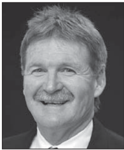
Bill Irwin, 2003-15